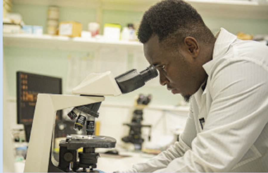
Sixteen experienced doctors and nurses from the Republic of Cuba (left) have arrived in Saint Vincent and the Grenadines to join our own medical professionals in the fight against COVID-19

O ur battle against COVID-19 is, first and foremost, a battle to protect the health of Vincentians. The Government of Saint Vincent and the Grenadines is making the urgent and necessary decisions to better equip our public health system to battle the pandemic.